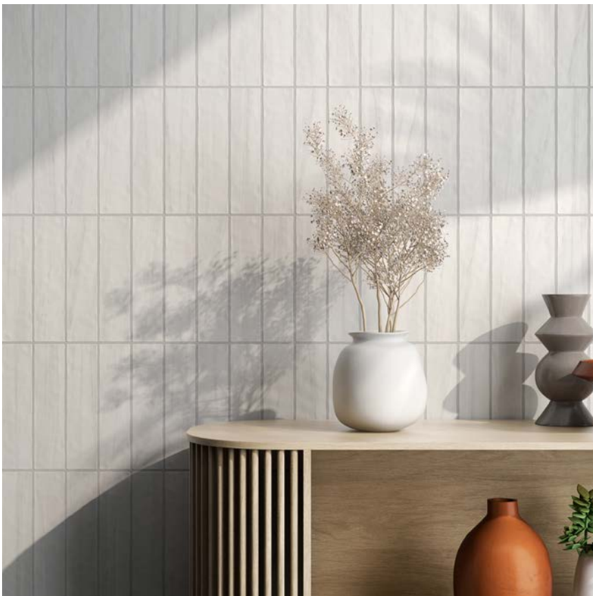
Wall Tile: 3x12