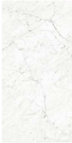
88JEWMAT1224 (matte) 88JEWMAT1224P (pol.)