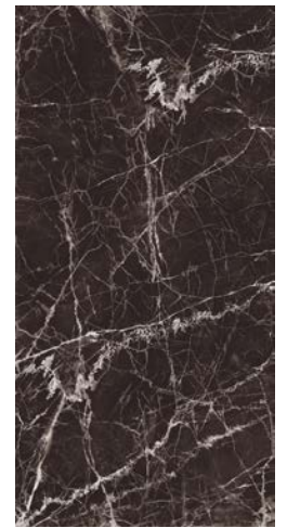
24x48 Polished only 88JEWMAU2448P