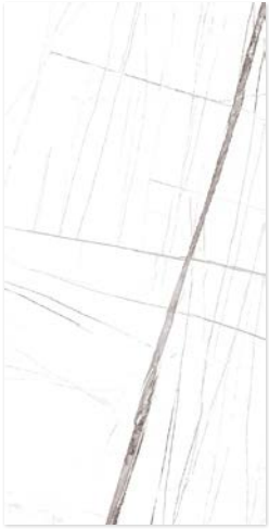
88JEWLAU1224 (matte) 88JEWLAU1224P (pol.)