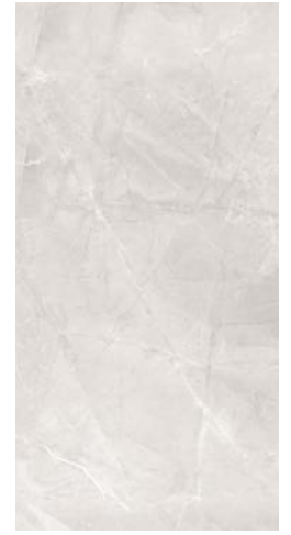
88JEWELI1224 (matte) 88JEWELI1224P (pol.)