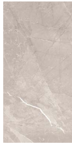
88JEWAGR1224 (matte) 88JEWAGR1224P (pol.)