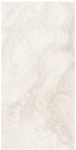
88JEWTHE1224 (matte) 88JEWTHE1224P (pol.)