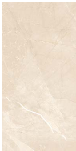
88JEWECR1224 (matte) 88JEWECR1224P (pol.)