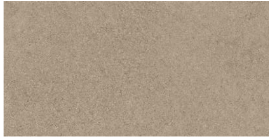
75MARCOP1224 (matte) 75MARCOP1224P (pol.)