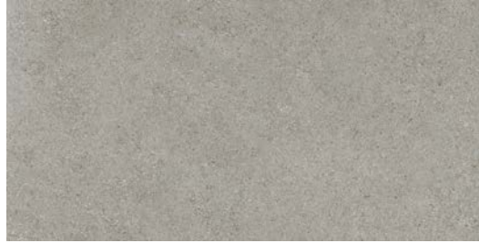
75MARSIL1224 (matte) 75MARSIL1224P (pol.)