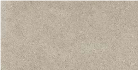
75MARTAU1224 (matte) 75MARTAU1224P (pol.)