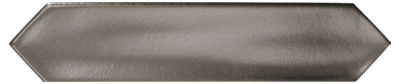
Alfama Pickets Silver 73ALF-SLVR Size: 2x10"