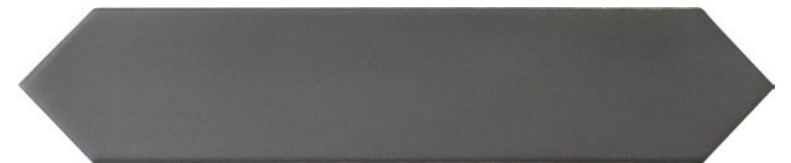
Alfama Pickets Black 73ALF-BLK Size: 2x10"