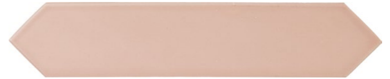
Alfama Pickets Rose 73ALF-ROSE Size: 2x10"