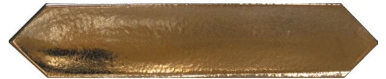
Alfama Pickets Gold 73ALF-GOLD Size: 2x10"