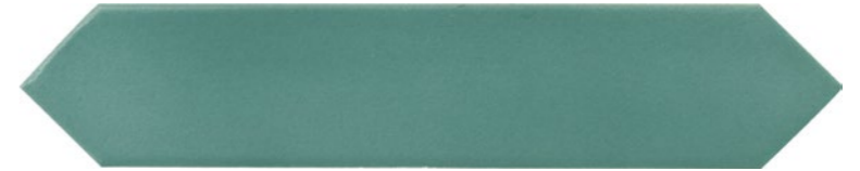
Alfama Pickets Viridian 73ALF-VIR Size: 2x10"