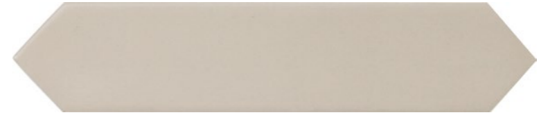
Alfama Pickets Muslin 73ALF-MUS Size: 2x10"