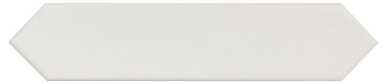
Alfama Pickets White 73ALF-WHT Size: 2x10"