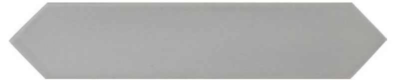
Alfama Pickets Gray 73ALF-GRAY Size: 2x10"