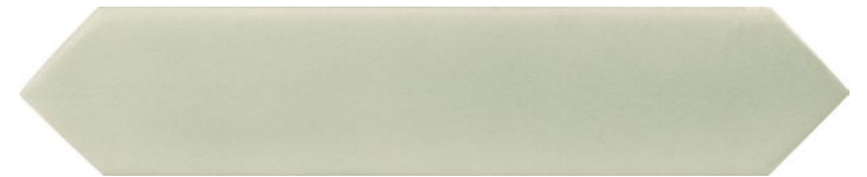
Alfama Pickets Mint 73ALF-MINT Size: 2x10"