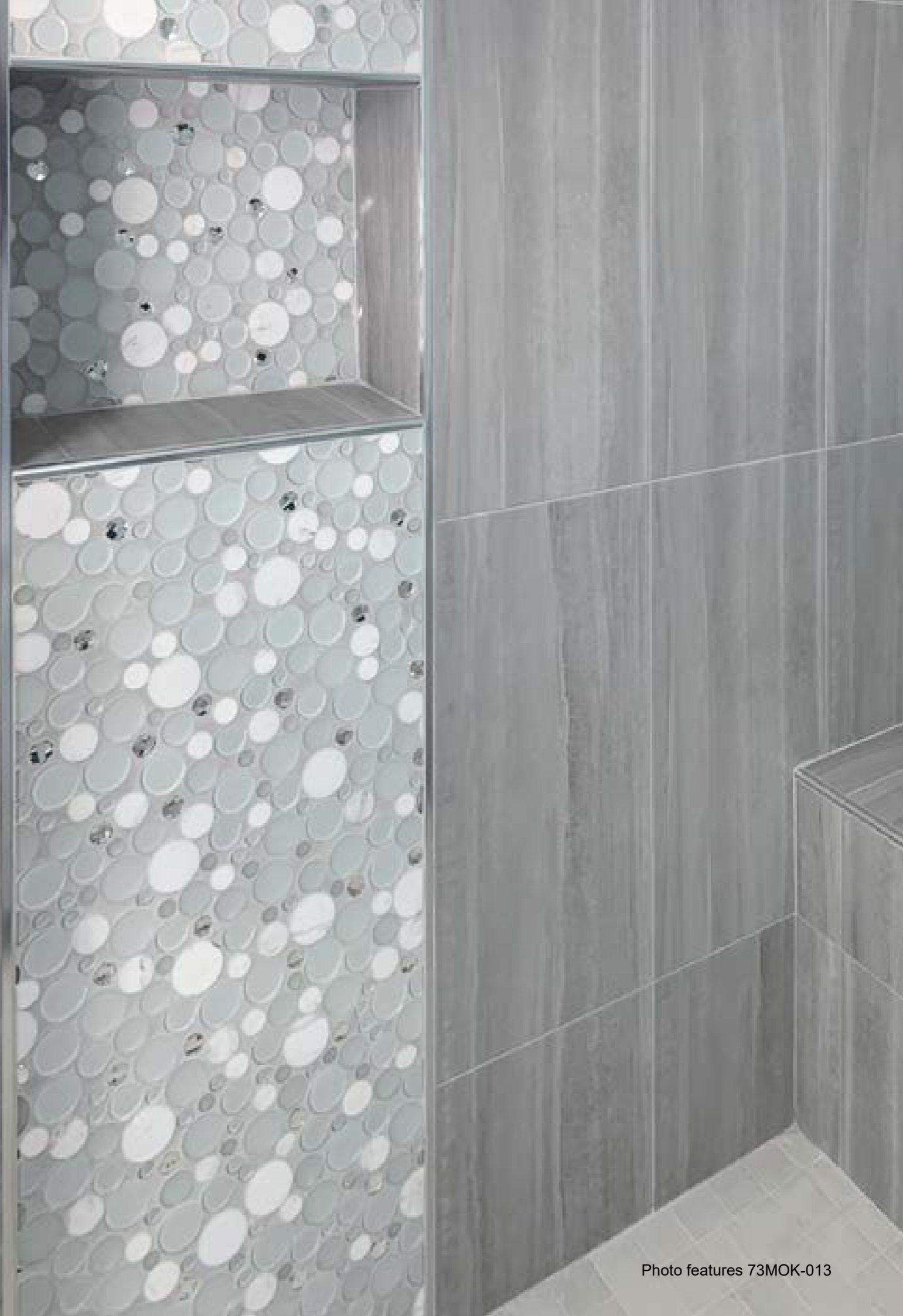
Photo features 73MOK-013

Variation in color, shade, finish, hardness, strength and slip resistance is inherent in Natural stone products. White marbles contain naturally occurring deposits of iron which may lead to discoloration of marble and turning it yellow-rust or gray if used in wet areas. These are natural characteristics of the stone and that is why it cannot be considered as a defect in the product. We are in no way responsible for discoloration of the natural stones.