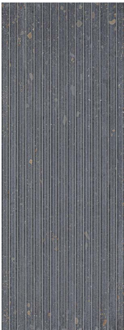
18x48 Graffi Wall Decor Matte