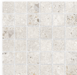
2x2 Mosaic Natural