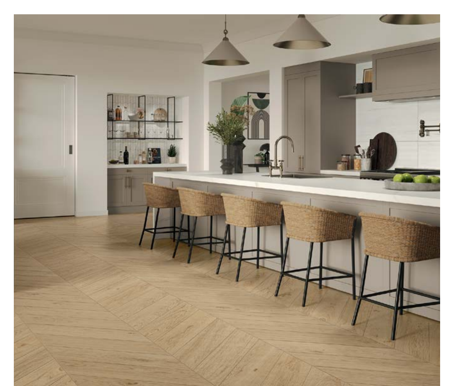
Tile: 8x40, 8x40 Chevron, 8x40 Spa