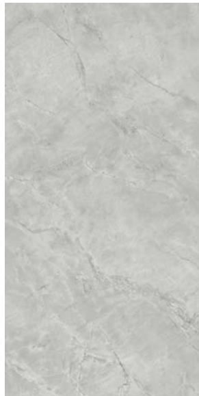
15MAXGRA1224P (Polished) 15MAXGRA1224 (Matte)