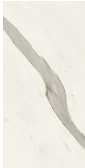
15MAXSUB1224P (Polished) 15MAXSUB1224 (Matte)