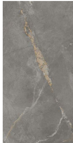
15MAXFIO1224P (Polished) 15MAXFIO1224 (Matte)