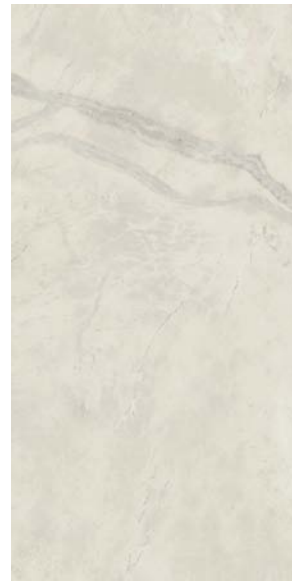
15MAXPER1224P (Polished) 15MAXPER1224 (Matte)