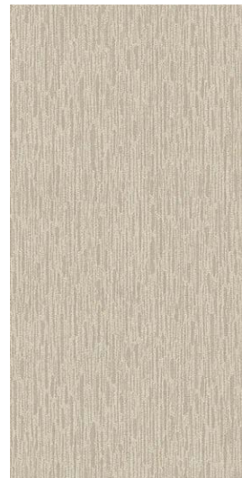
15FRXALM1224T Almond Trama Wall