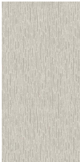
15FRXMIS1224T Mist Trama Wall