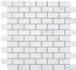
Brick Wall Mosaic