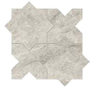
Star & Cross Mosaic