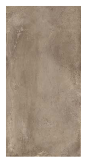
04ONEMUD1224 (matte) 040NECHA1224P (polished) 040NEGRE1224P (polished) 040NEMUD1224P (polished)