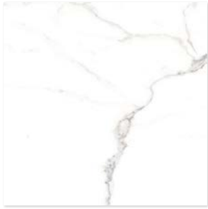
04LUXCAL12 (matte) 04LUXCAL12P (polished)