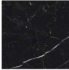
04LUXNER12 (matte) 04LUXNER12P (polished)