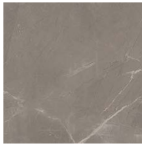
04LUXAGR12 (matte) 04LUXAGR12P (polished)