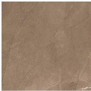
04LUXABR12 (matte) 04LUXABR12P (polished)