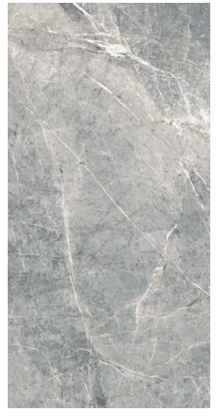
04EPIIMP1224 (matte) 04EPIIMP1224 (polished)