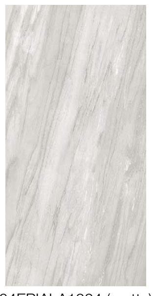
04EPIALA1224 (matte) 04EPIALA1224 (polished)