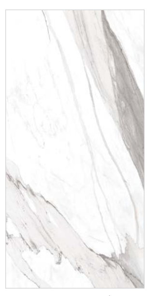
04EPIAPU1224 (matte) 04EPIAPU1224 (polished)