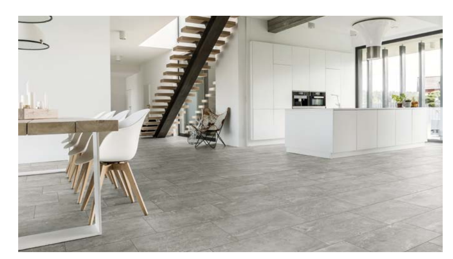
Tile: 12x24 Mosaic: 2x2