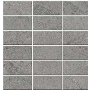
2x4 Stacked Mosaic