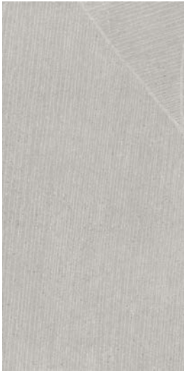
03SDG011224SPO (semi) 03SDG011224 (unpol)