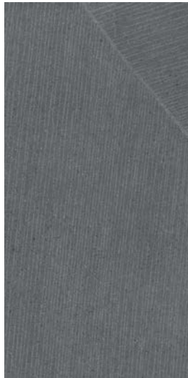
03SDG041224SPO (semi) 03SDG041224 (unpol)