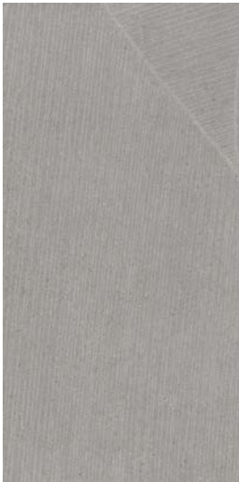
03SDG031224SPO (semi) 03SDG031224 (unpol)