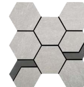
NVM02 Hex with Iron