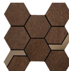
NVM04 Hex with Gold Available with Iron