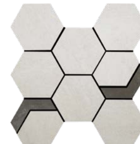
NVM01 Hex with Iron