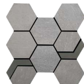
NVM03 Hex with Iron