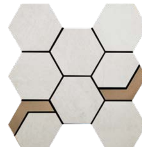
NVM01 Hex with Gold