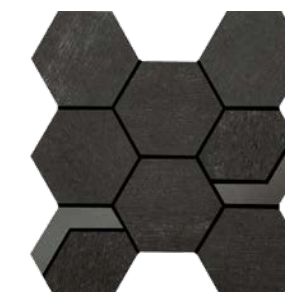
NVM06 Hex with Iron