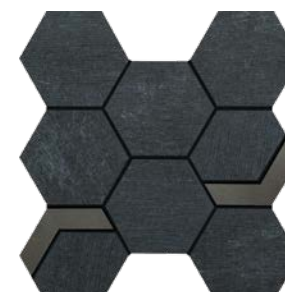
NVM05 Hex with Iron