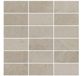
2x4 Stacked Mosaic