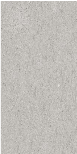
03CIV031224SPO (semi) 03CIV031224 (unpol)