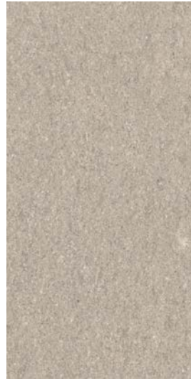
03CIV051224SPO (semi) 03CIV051224 (unpol)