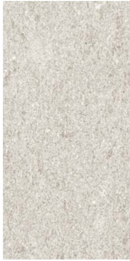
03CIV021224SPO (semi) 03CIV021224 (unpol)