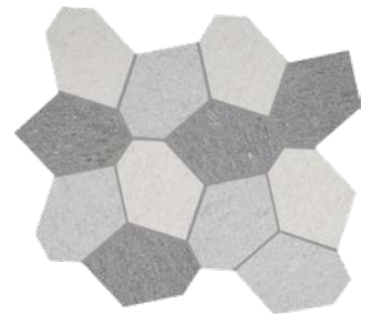
Cool Blend Polygon