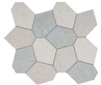
Light Blend Polygon