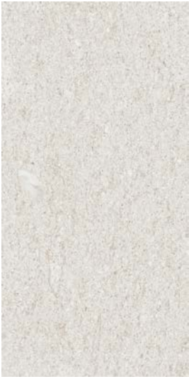
03CIV011224SPO (semi) 03CIV011224 (unpol)