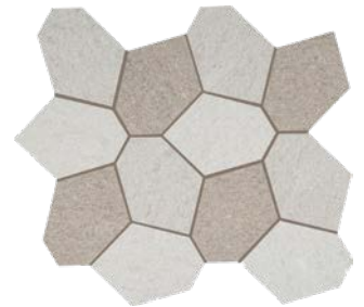
Warm Blend Polygon Also in all solid colors