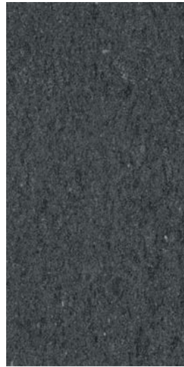
03CIV061224SPO (semi) 03CIV061224 (unpol)